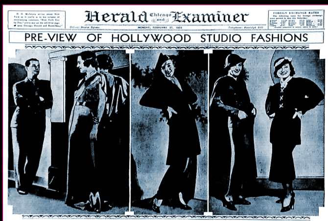
Chicago Herald and Examiner article. February 27, 1933.

the films for which they were created. You may recognize Vivian Leigh's green velvet dress from Gone with the Wind , Audrey Hepburn's shoulder-bowed black cocktail dress in Sabrina , and John Travolta's white leisure suit from