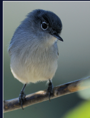
California Coastal Gnatcatcher.

The UCI Libraries preserves and makes accessible the world's largest collection on the history of the Orange County region, including records in all formats representing the mission period to the present.