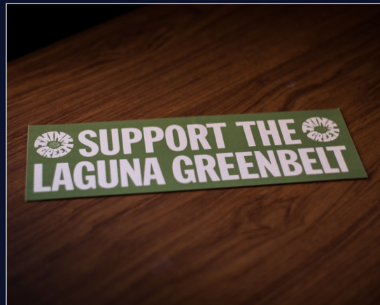
Support the Laguna Greenbelt bumper sticker.

Explore • Discover • Advance UCI Libraries