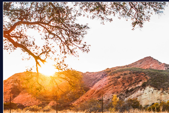
Red Rocks of Black Star Canyon in the Irvine Ranch Open Space.

We seek your support to document the lives and impact of the communities in our region as part of our ongoing effort to reflect the rich heritage of Orange County.