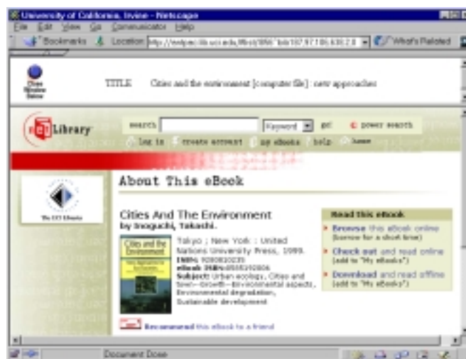
Accessing a netLibrary eBook via Antpac.

UCI librarians are participating in a UC systemwide task force that is defining operating guidelines and desirable features that will make eBooks as useful as possible for instruction and research. The task force also will evaluate eBook experiences at all UC campuses via independent netLibrary experiments, examine eBook experiments at other universities and from other content providers; and identify systemwide strategies warranting further exploration.