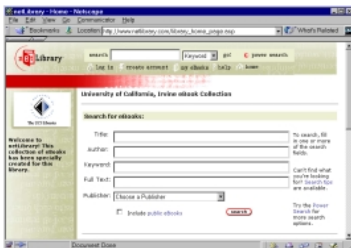
netLibrary's UC Irvine eBook Collection search screen