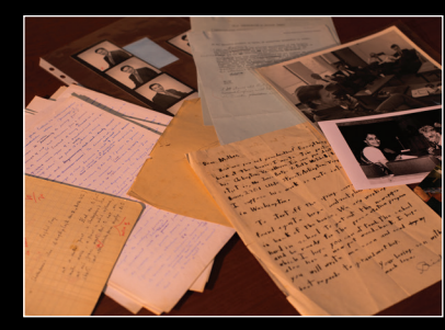
Items from the Critical Theory Archive.

Critical Theory Emphasis encourages scholars and students to explore, and to develop,