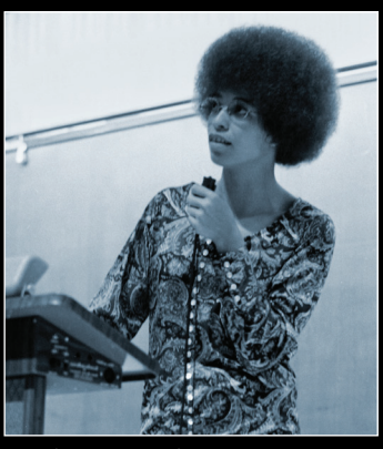
Angela Davis Speaking at UCI, October 1969.

theoretical models to analyze literature and art, and general systems of information, including history, language, and political relations. With the recent emergence of the Theory and Culture