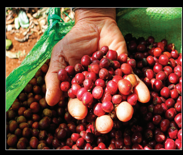
A farmer shows a handful of freshly picked coffee fruit or "cherries" in Vietnam.