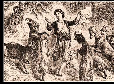
"Kaldi" dancing with his herd of caffinated aoats

From Bean to Brew shows how a shrub growing in the highlands of Ethiopia became the source of one of the world's most popular