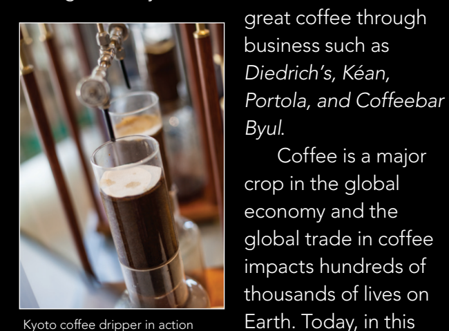
Kyoto coffee dripper in action at Portola Coffee Lab. Costa Mesa, Ca

era, our daily cup is more and more likely to be brought to us following principles of fair trade and good labor practices.