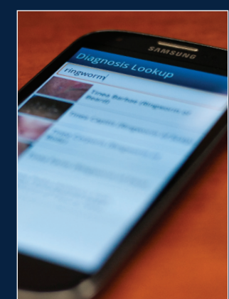
Screenshot of the VisualDX mobile app.

innovative interdepartmental gateway program leading to a PhD degree in either Chemistry,