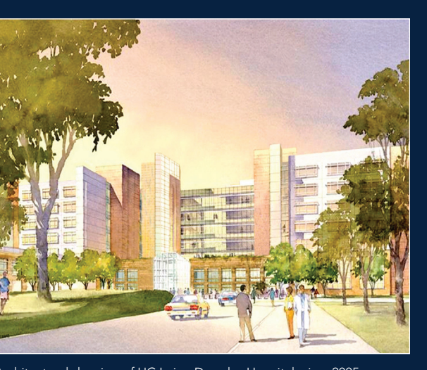
Architectural drawing of UC Irvine Douglas Hospital, circa 2005.

nurturing training in Translational Science, and teaching students how to "fast-track" promising research discoveries into clinical trials. Finally UCI's health education does not end with students graduating. The campus shares health information with the public through bulletins, news releases, and classes. The use of open access journals and the development of open access UCI and UC digital archives for research papers and experimental data means that the fruits of UCI's vibrant research community are increasingly available to everyone.