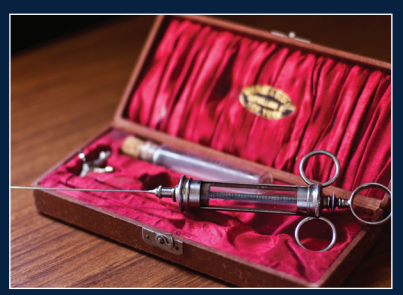
" Vintage Syringe. ca. 1948." California College of Medicine Records [AS-027].

Medical education at UCI had two beginnings. One occurred when the UCI College of Medicine opened April 5, 1967. But its earlier