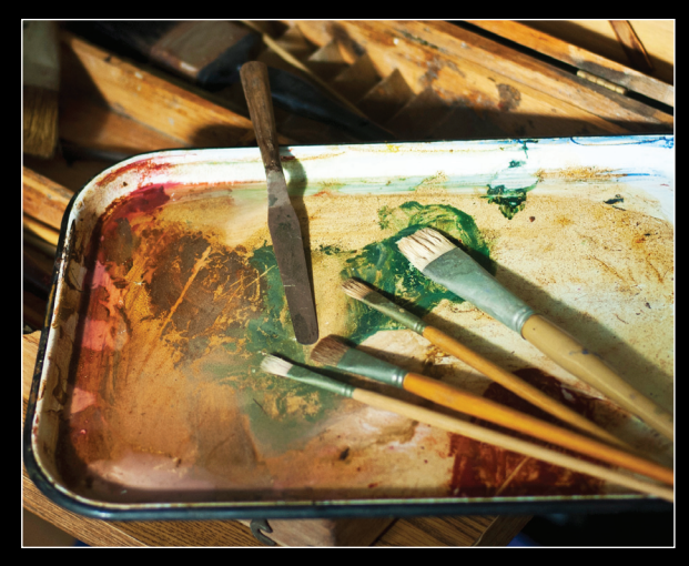
Isaac Frazee's Paint Box. UCI Libraries Special Collections and Archives. Isaac Frazee Family Papers [MS-R022].

The history of the Laguna art colony is an important part of the cultural legacy of Laguna Beach and California. Interest in California Impressionism remains significant due, in large part, to the efforts of local art museums and other cultural heritage institutions.