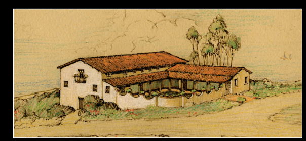
"Rendering of Proposed Final Gallery Design." Myron Hunt and C.C. Chambers.

the Art Association involved numerous strategies, including pageant plays, which were the precursors of the Pageant of the Masters. Most of the funds that kept the Association