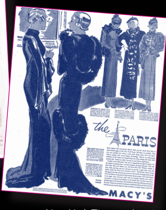
New York Times advertisement for Macy's Department Store. September 17, 1933.

besides gorgeous weather—the Los Angeles basin still had considerable natural scenery and could be made to look like the Alps, the South Seas, or the Sahara.