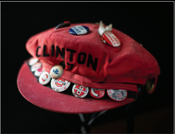
Donald McKayle's high school era hat.

Explore • Discover • Advance UCI Libraries