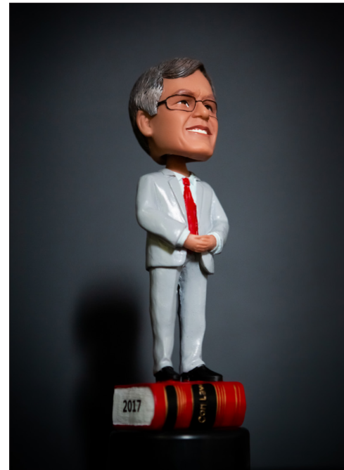
Erwin Chemerinsky bobblehead, created as part of the UCI Law Class of 2017 class gift campaign.

UC Irvine School of Law is a vibrant community with a rich history that includes extraordinary students, world-renowned faculty, dedicated administrators and staff, engaged alumni, and enthusiastic supporters. Through culmination of generations of revolutionary dreamers, UCI Law