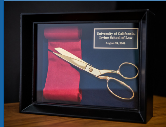
Acrivi Coromelas, UCI Law's first student, used these scissors to cut the ribbon ceremonially opening the law school on the first day of classes, August 24, 2009.

For the full exhibit checklist with annotations, online exhibits, and past exhibits, please see: