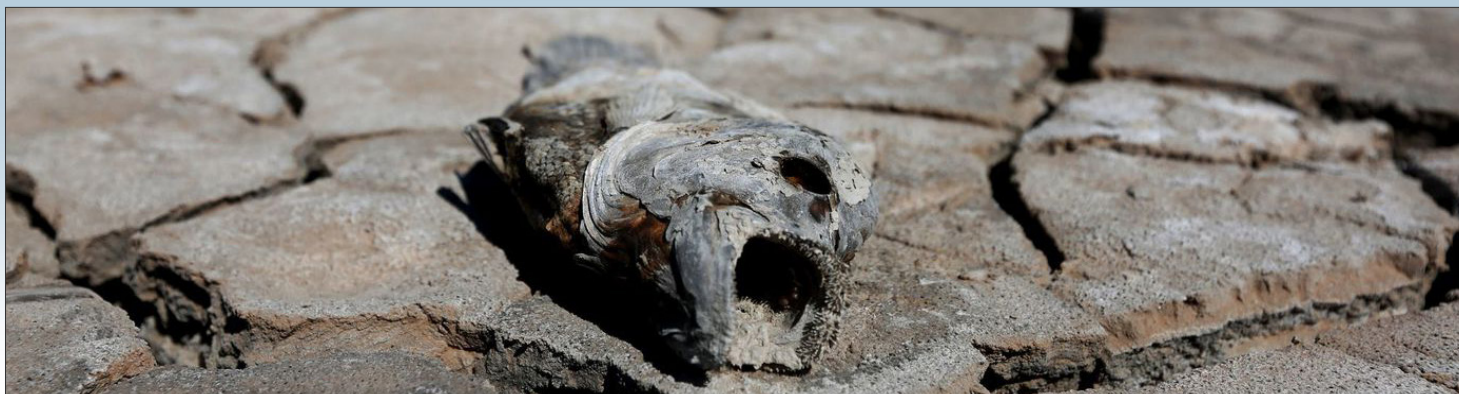
Dead fish litter the Salton Sea shoreline where the salinity level has become so high that the Tilapia can no longer survive.

Thank you for your support of the UCI Libraries!