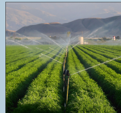
Crops getting watered in California's central valley farming communities.

Support for the acquisition, preservation, and accessibility of materials helps to ensure that we are able to continue to enhance the value of a student's educational experience and lead researchers to new discoveries.