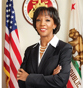
Jackie Lacey '79

Since 1971, the UCI Alumni Association and its board of directors has presented Lauds & Laurels, the association's highest honor, at a formal ceremony each spring. Lauds & Laurels is the university's oldest awards ceremony, a tradition that has recognized and honored more than 750 outstanding alumni and members of the UCI community for their service to the university, the community, or their profession.